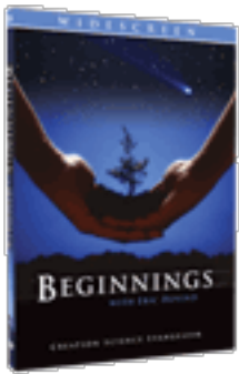
Beginnings Series #109DVD