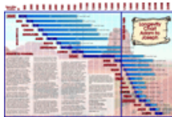
Longevity Chart #709

To order, visit www.creationstore.org or call 1-850-479-3466.